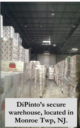
DiPinto's secure warehouse, located in Monroe Twp, NJ.